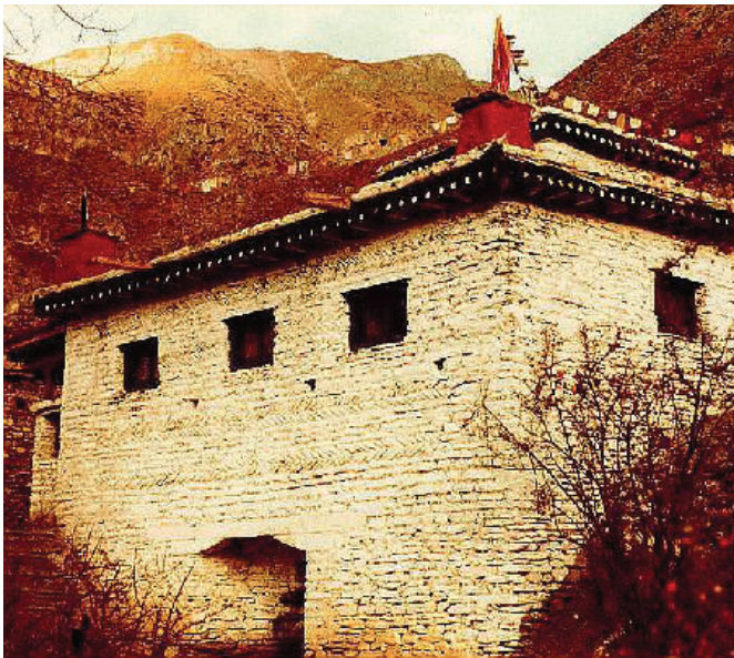
The "Temple Of Miraculous Fire" at Muktinath, Nepal. Photo by Ken Street (Nov. 1979).

[For more on this subject, please read our tract The Temple Of Miraculous Fire .]